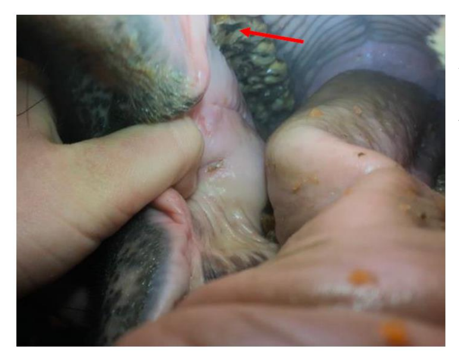
Figure 1: Infundibular necrosis caused by dental caries. It is important to identify these problems before the bacteria involved enter the blood stream and cause profound health compromise.

Just like us horses have a limited amount of teeth tissue, so their teeth just wear out after the age of fifteen. And again, like humans, it is how their teeth are managed when they are younger that determines their dental health when older. Horses even develop all the same dental problems as we do, from caries and broken teeth to gum disease (see Figure 1)! Research suggests that as many as two thirds of horses will be experiencing dental problems leading to pain at any one time. Younger horses (less than 6 years of age) and older horses (over 15 years of age) are more vulnerable. The teeth of foals and young horses are softer while older horses will develop brittle or diseased teeth that break and infections in the tissue around the teeth.